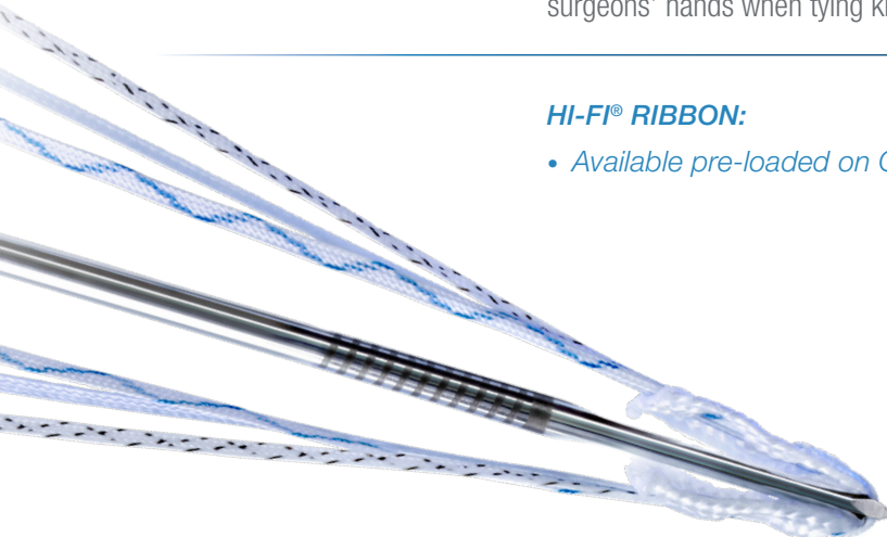
Y-Knot® RC Self-Punching All-Suture Anchor WITH 3 HI-FI® RIBBON SUTURES

Y-Knot Try It? Schedule a demonstration with your local CONMED Sales Representative or, visit CONMED.com/Ribbon .