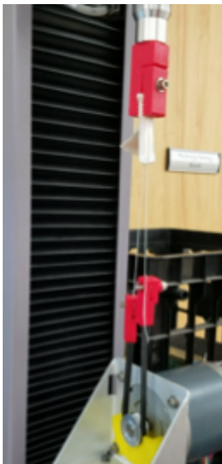
Figure 1. Tendon and suture tape loaded on MTS machine

After 50 sawing cycles, the resulting cut in the tendon by the suture tape was measured by the displacement of the upper head of the MTS machine. Each pair of Hi-Fi® Tape and FiberTape were threaded through the same incision to account for differences in tendon quality.