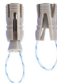
Table 1: Properties of two anchors tested.