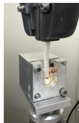
Figure 1: Tendon loaded at 90° on MTS machine.

The synthetic tendons were secured to a calibrated MTS machine at 90° to simulate the directional pull of the biceps tendon. Tendons were cycled from 10-90 N for 5000 cycles at 1 Hz, then pulled to failure at 50 mm/min.